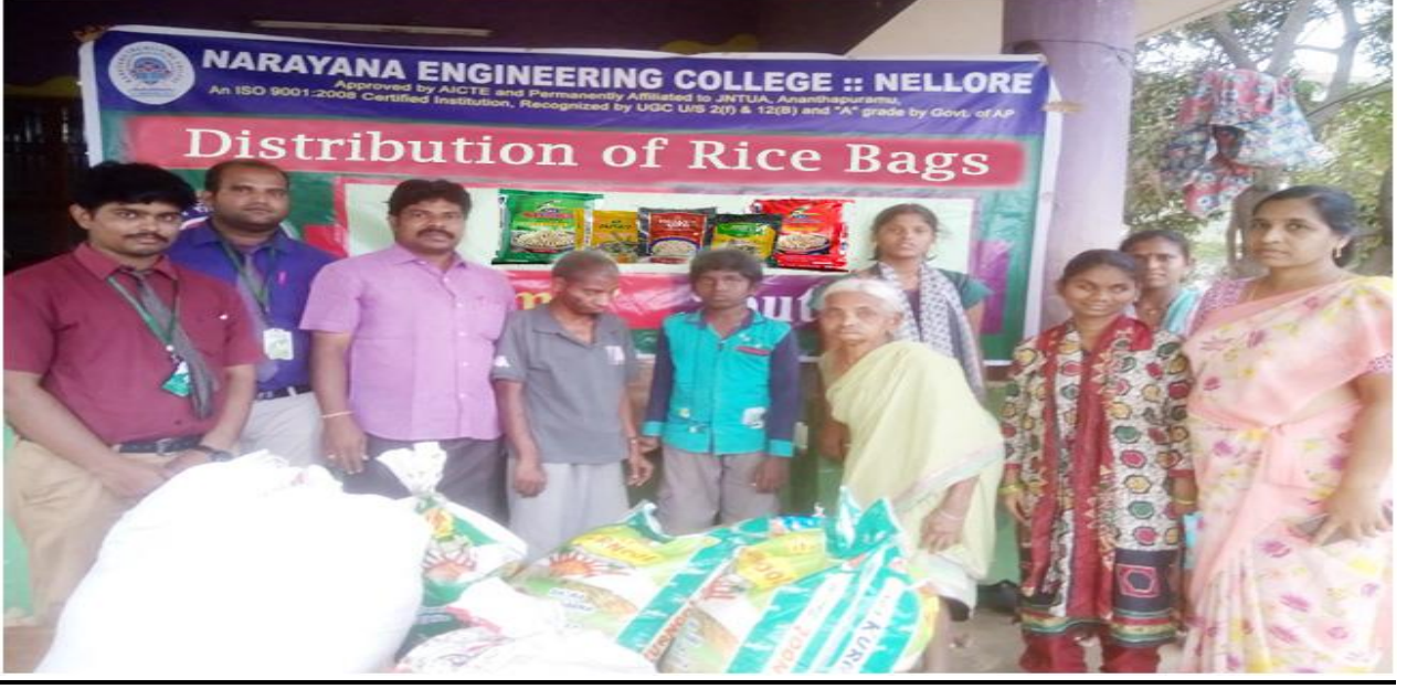
Distributing Rice Bags at Vatsalya Orphanage Home.