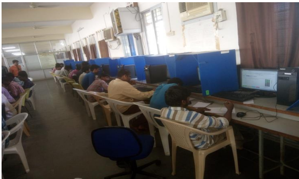
Senior Intermediate students at online EAMCET MOCK TEST