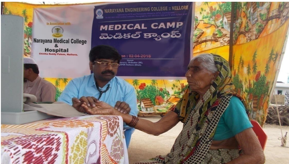
Doctor testing the Patient