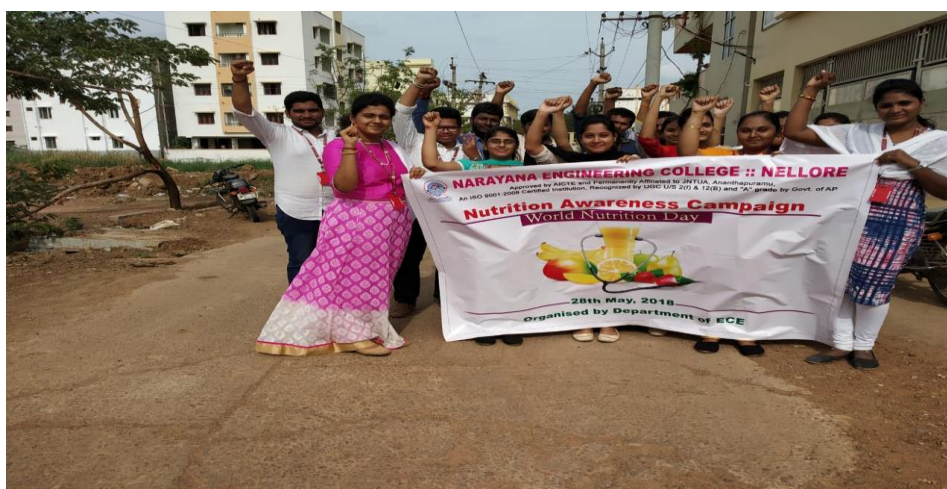
Staff and Students of NECN participating in nutrition awareness campaign