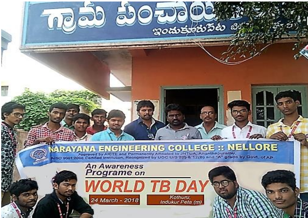
Awareness program on World TB DAY at Indukur Pet Mandal, Kotturu, SPSR Nellore.