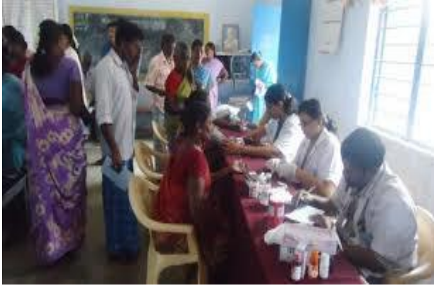
Narayana Medical College and Hospital Doctors examining the people of Chinta Reddy Palem, Nellore