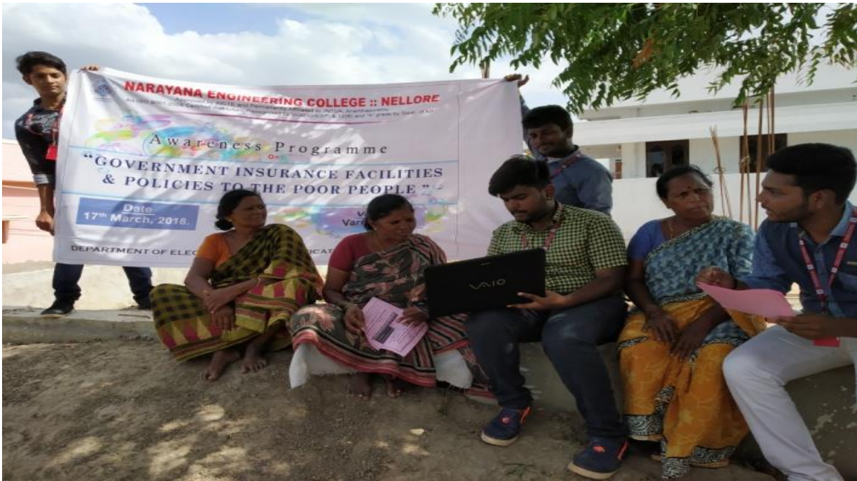
Faculty members and students creating awareness on various govt. schemes to the villagers and distributed handouts to them