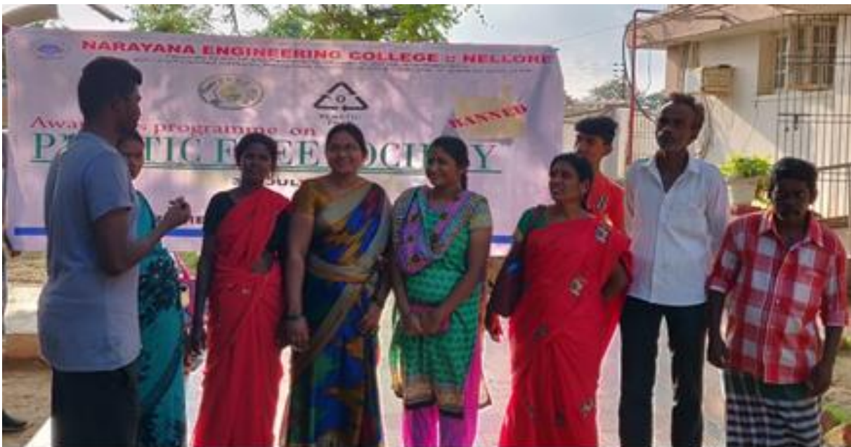
Staff explaining the consequences of Plastic Waste