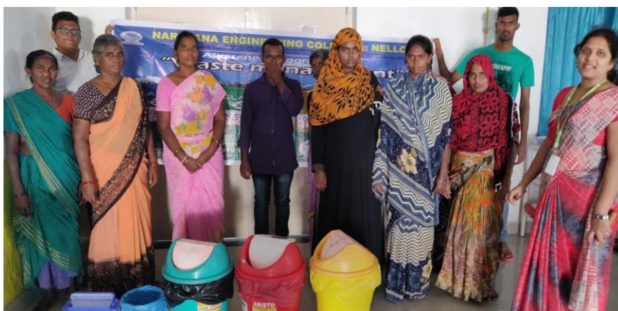
NECN staff explaining the importance of waste Management to the patients and House Keeping staff of Narayana Medical College and Hospital, Nellore