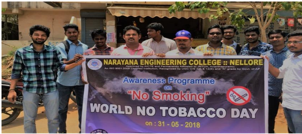
Staff and students of NECN explaining the consequences of Tobacco