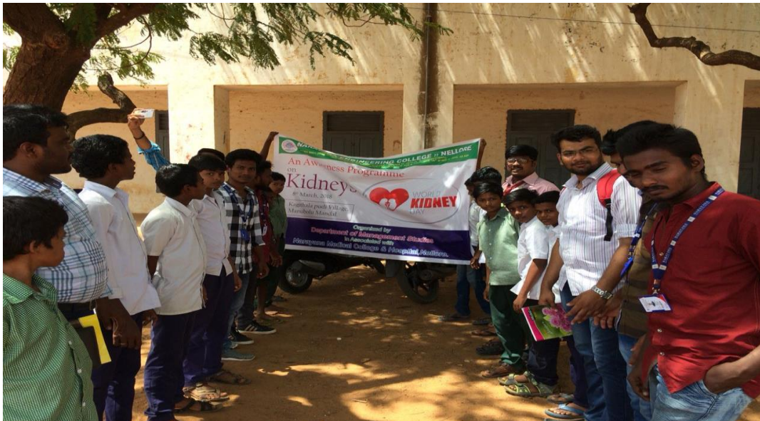
Staff and students explaining the importance of Kidney at Kagithalapudi Village.